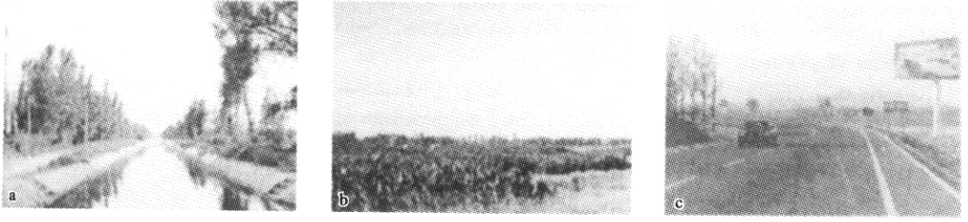
Fig.2 a. The channels in the oasis transfer the river and reservoir water to farmlands. There are poplar and shrub along them. b. Among the farmlands there is manual protection forest net that mainly makes up of poplars and distributes in a line. Its width is from one to two trees width, from three to five meters. c. Road corridor mainly imports and exports substance

corridor types and most extrusive characteristics, which principally distributes among the farmlands and oasis edge (Fig. 2b). Nowadays, 110000 km 2 farmlands have been constructed forest nets on shelterbelt network in North, Northwest and Northeast China. A lot of counties in Chinese arid regions have established consecutive and large-scale protection forest system. They obstruct desert landscape expansion and incursion and protect farmland, road and channel. A great deal of observation data show that the wind speed near the earth surface can decrease thirty to fifty percent in the efficient protection extension of the forest net and the provision product net increase ten to thirty percent (Xiao, 1999). Because the forest nets in oasis mainly make up of arbor, they almost have no influence on the creatural habitat.