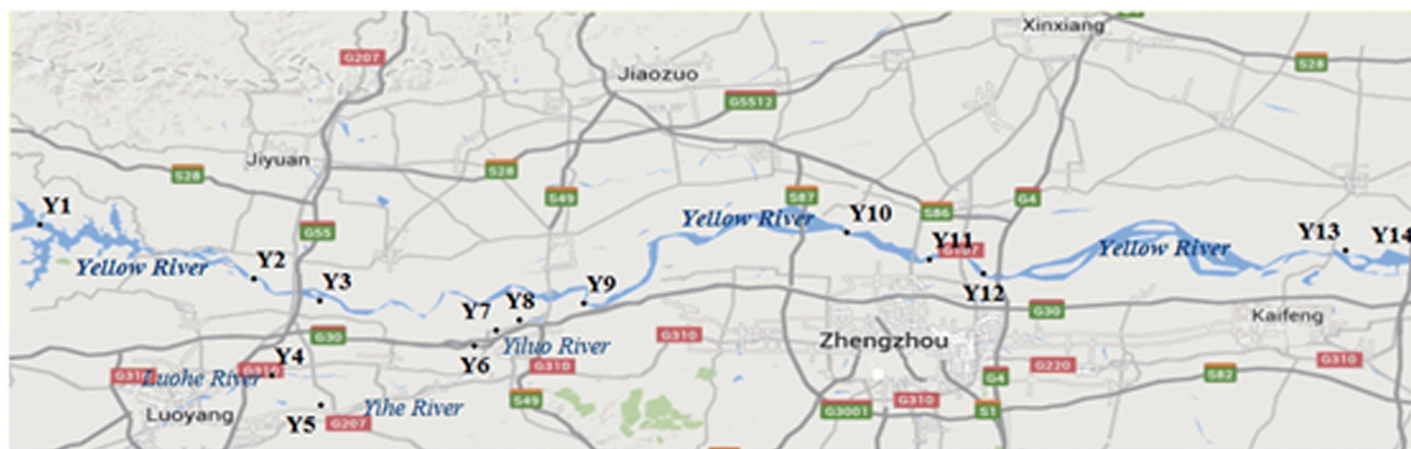
Fig. 1 – Map of the sampling sites in the middle reaches of Yellow River.

where, P_i is the single pollution index; C_i (mg/kg) represents the measured average concentration of heavy metals; S_i (mg/kg) is